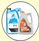
Motor Oil and Antifreeze