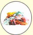
Clothing and Textiles