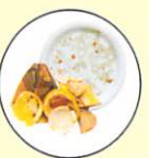
Food Scraps and Food-Soiled Paper