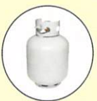
Propane Tanks* *20 lbs or smaller